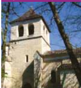
2 Notre-Dame de Saux Church, Montpezat de Quercy