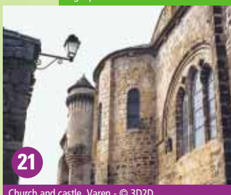
21 Church and castle, Varen - © 3D2D