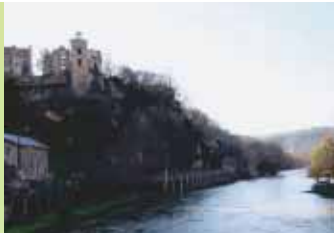
23 St-Martin Castle, Laguëpie