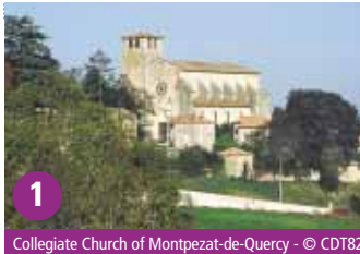
1 Collegiate Church of Montpezat-de-Quercy