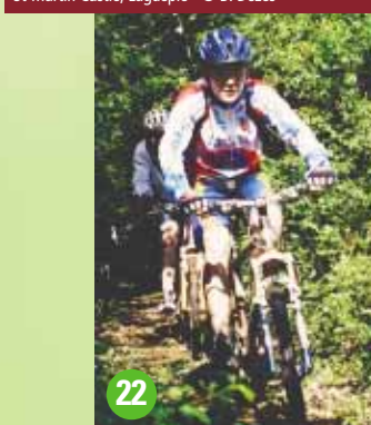
22 Mountain bike trail approved by the French Cycling Federation, Laguëpie