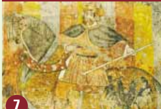
7 Mural paintings at Bioule Castle