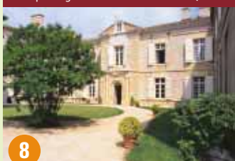
8 Marcel Lenoir Museum, Montricoux