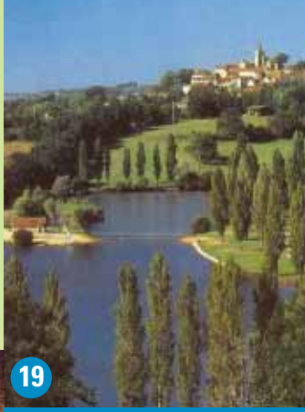
19 Parisot outdoor leisure area