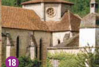
18 Cistercian Abbey at Beaulieu, Ginals