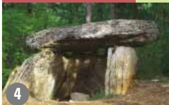
4 Finelle dolmen, Septfonds - © J.M. Labarta