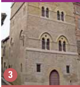
3 Arlet Tower, Caussade