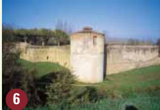
6 Castle ruins, Nègrepelisse