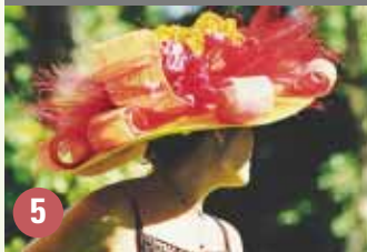
5 Hat workshops and exhibition, Caussade