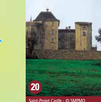
20 Saint-Projet Castle